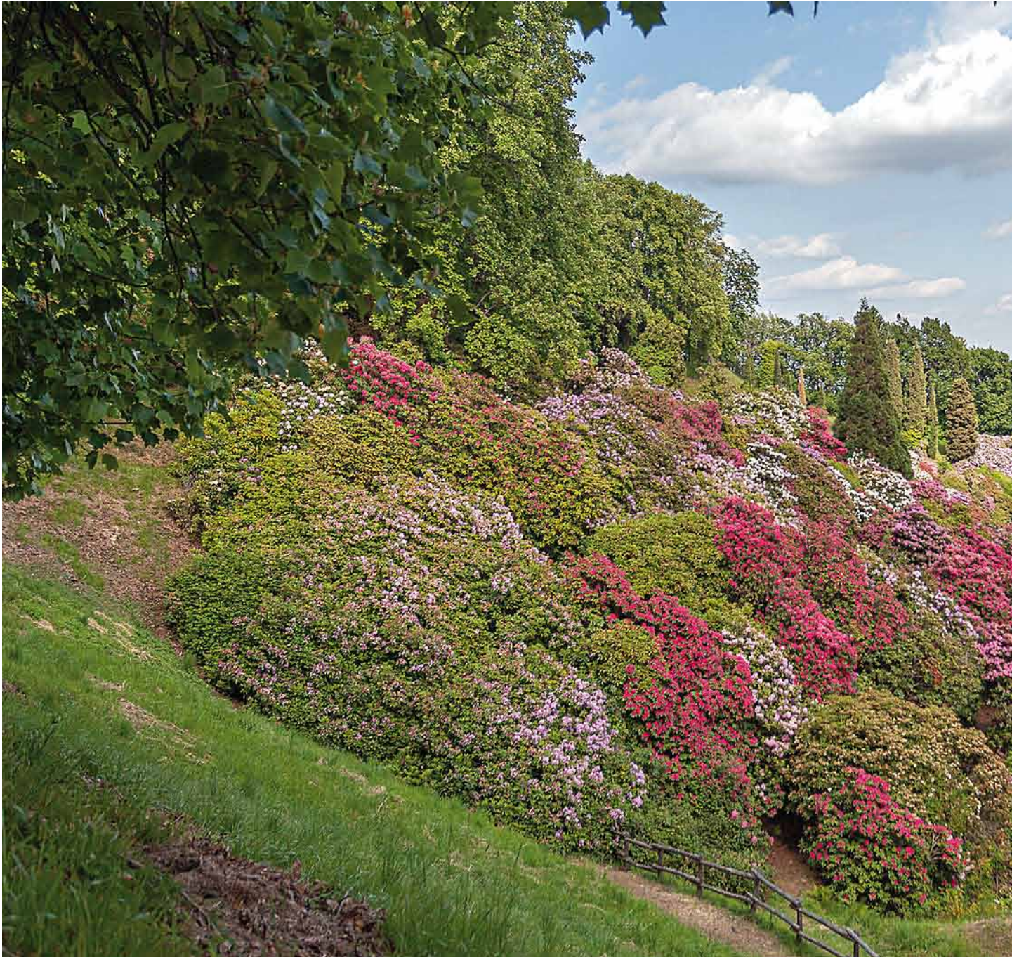
View of Burcina