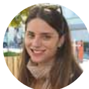
Maria Joao PIRES